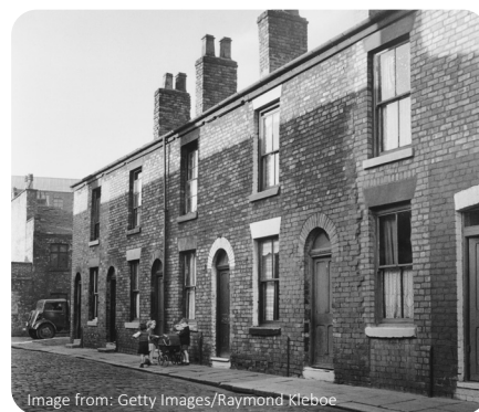
A street in the 1950s.

The way people use land changes over time. For example, in the 1950s there were fewer cars, so fewer roads were needed. Today lots of people have cars, so there are many more roads for people to drive on and driveways for parking.