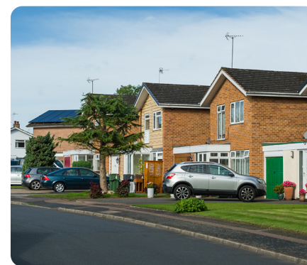
A street today.