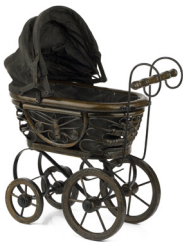
wood and metal pram