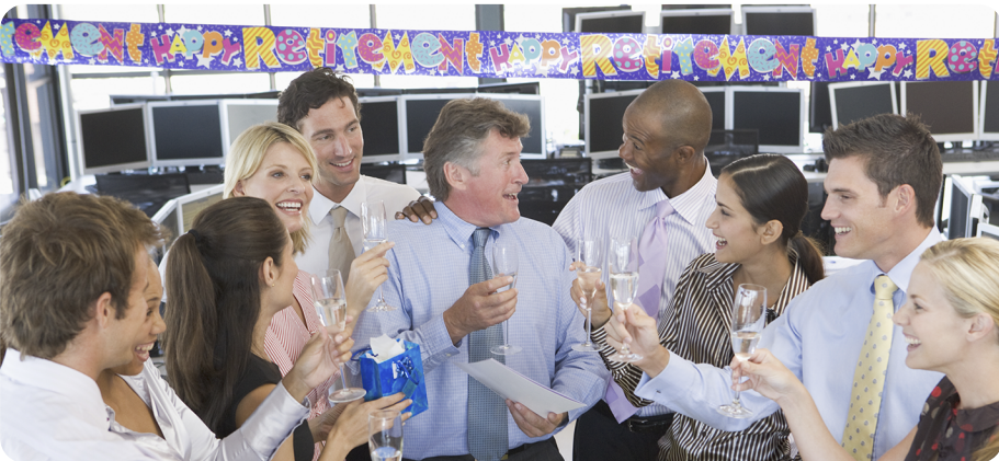
Retirement happens when an elderly person leaves work.