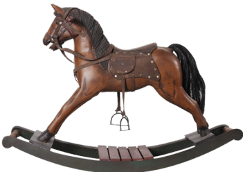
wooden rocking horse