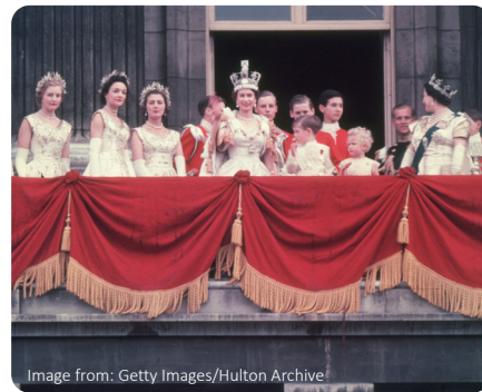
Queen Elizabeth II on her coronation.

A coronation is a ceremony where the crown is placed on the head of the new king or queen. Elizabeth II is the Queen of the United Kingdom. The coronation of Elizabeth II took place on 2nd June 1953 at Westminster Abbey, London. Many people celebrated the coronation by holding street parties.