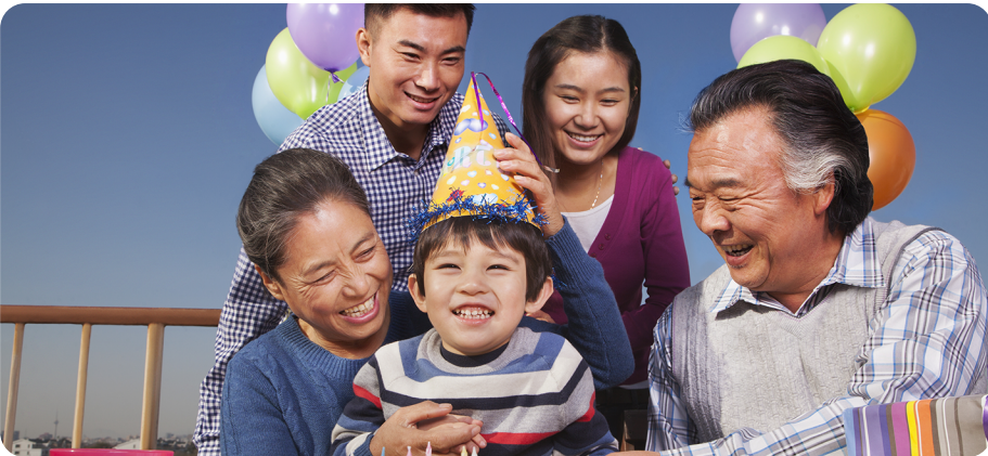
Birthdays happen every year.

Important life events include birthdays, religious festivals or family celebrations. Some life events happen every year and some happen at certain stages of human life.