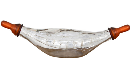
Victorian baby bottle

An artefact is an object from the past. Museums often display historical artefacts. Artefacts can tell us about how people used to live. Everyday objects like baby bottles, clothing, toys and books can tell us about childhood in the past.