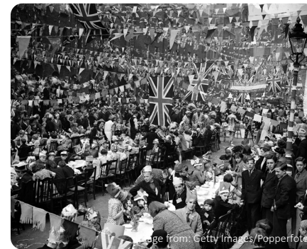
Street party to celebrate the coronation.