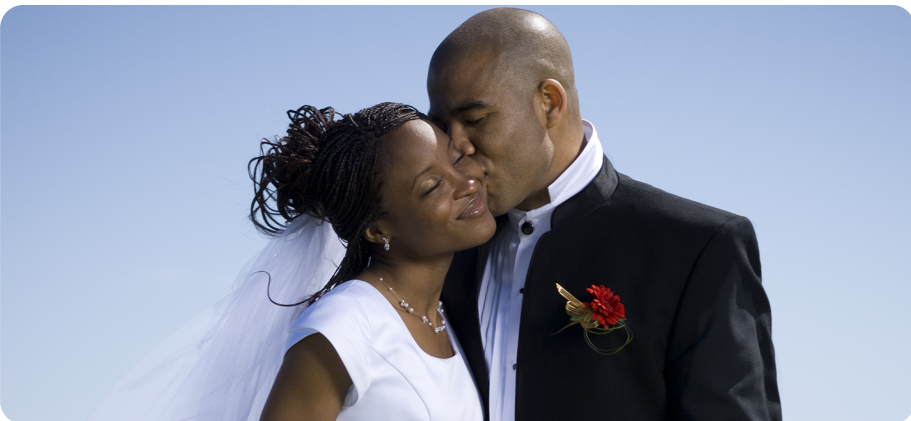
Weddings happen when two adults get married.