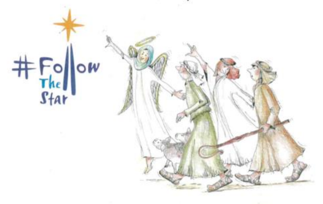
Sunday 22nd December at 2.30 pm