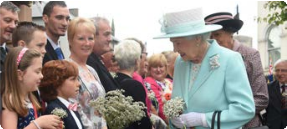
The Queen meets lots of people.

Elizabeth II is the Queen of the United Kingdom. She was born in 1926 and became queen in 1952. The Queen is married to Prince Philip and has a large family. She lives in Buckingham Palace in London. The Queen is very important. She visits charities and schools in the United Kingdom and welcomes world leaders to Buckingham Palace.