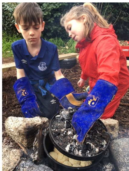
Sycamore Forest School session this week

Well Done to winners Sycamore Class this week with a outstanding 99.3% attendance!